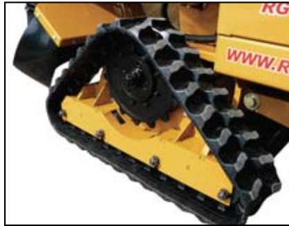
Rubber Track Undercarriage