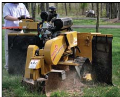
Swing-Out Chip Retainers