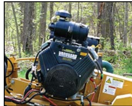
35 hp Vanguard Engine