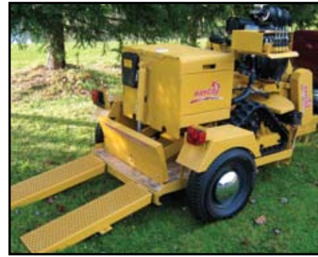
Available with Custom Trailer