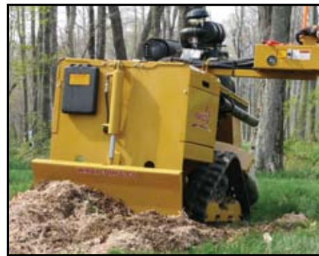
Hydraulic Backfill Blade