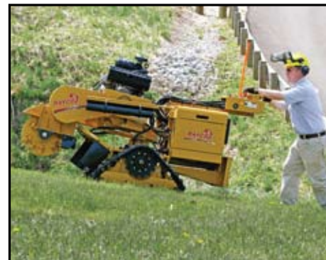
2-Speed Ground Travel