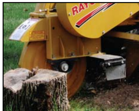
47.5" Cutting Width